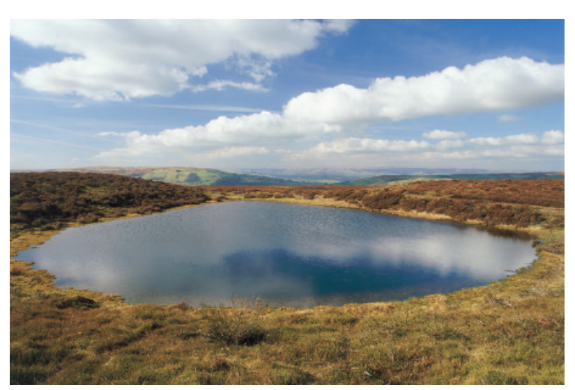
A quiet pool in the Radnorshire Hills, near Twm Tobacco's grave.